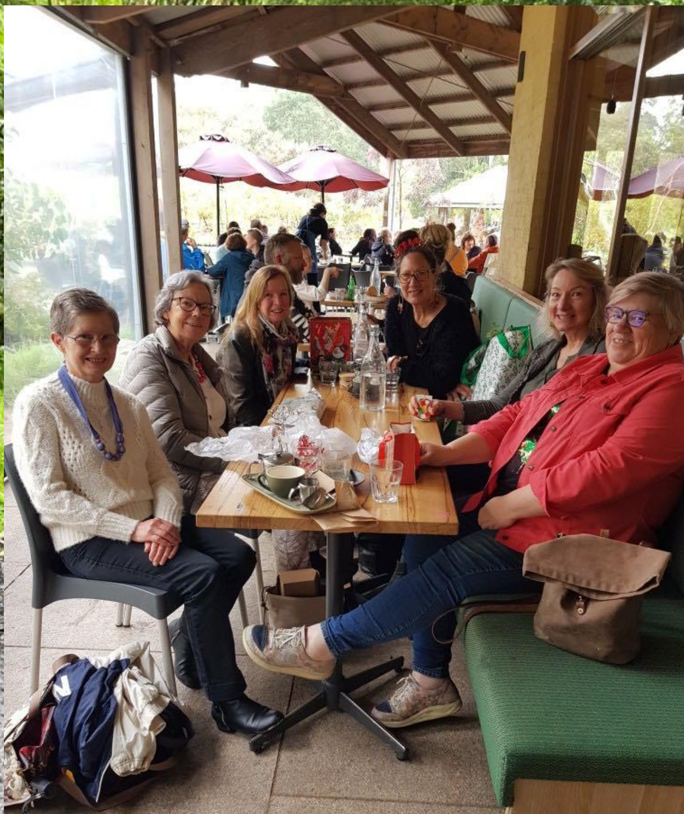
Ladies Annual Christmas Dinner